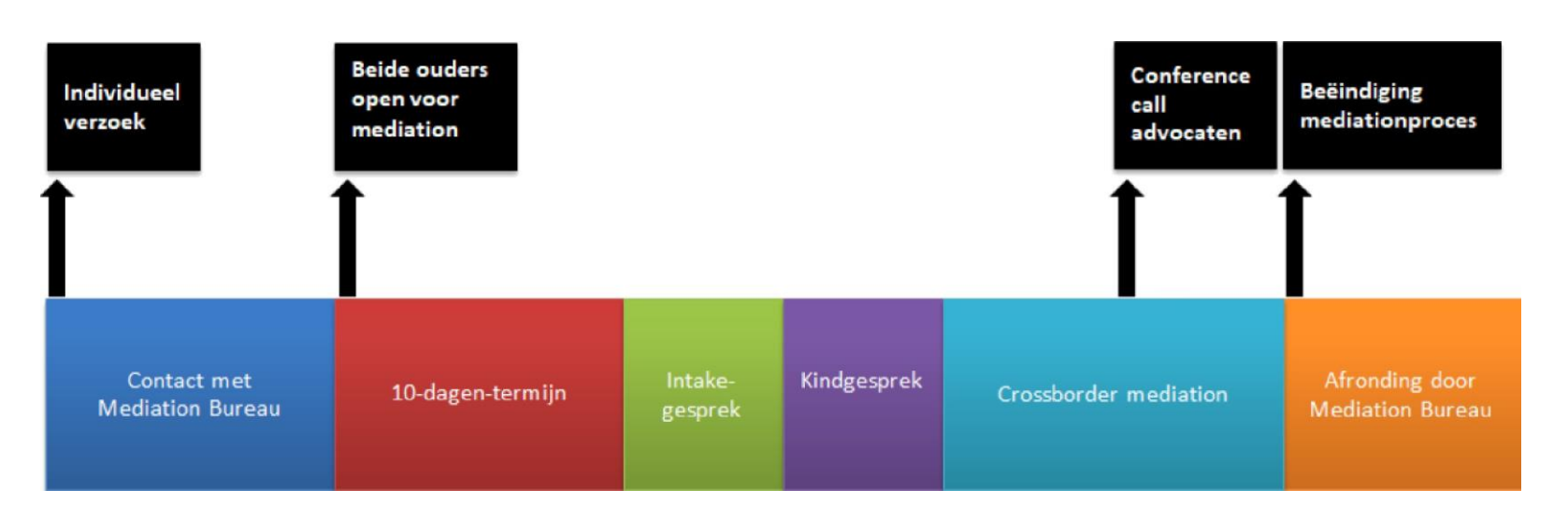
Figure 1. Picture of the mediation process.